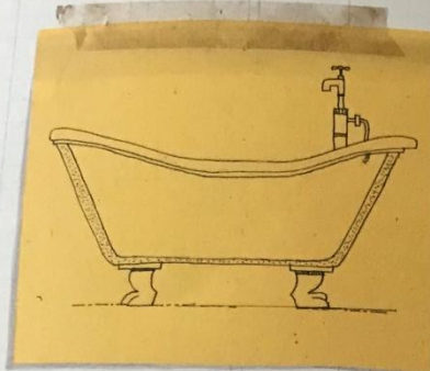
Fig. 1: Empty