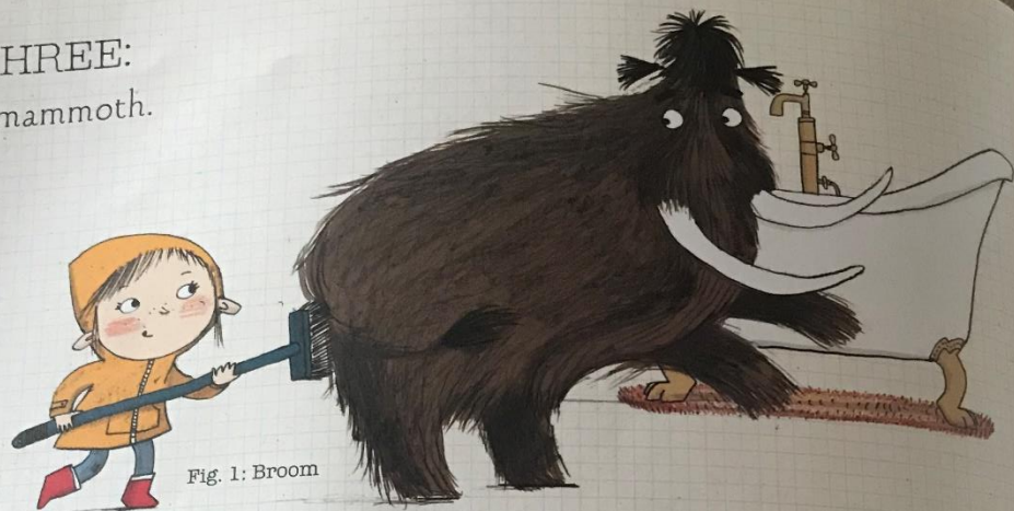
Fig. 1: Broom