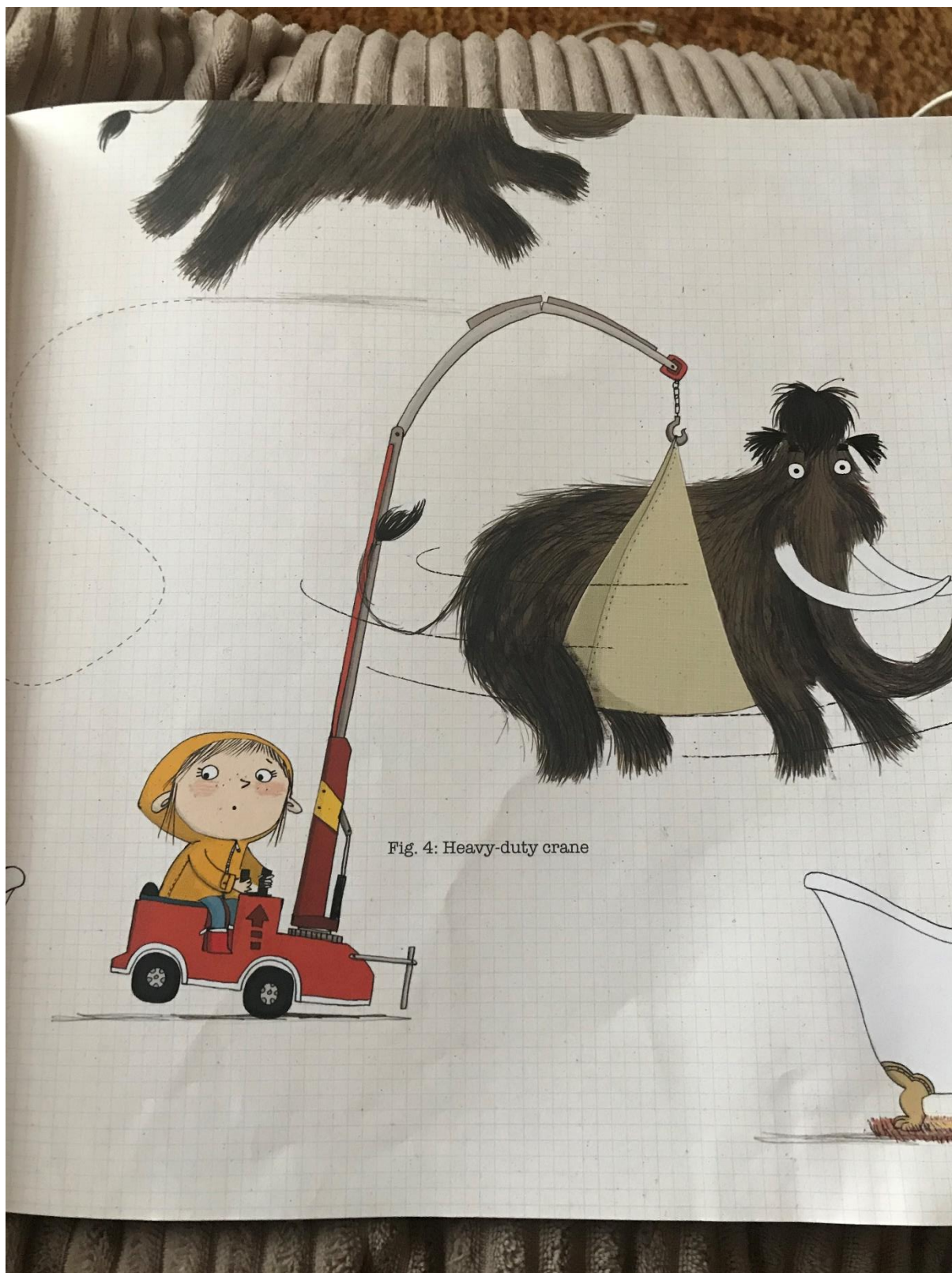
Fig. 4: Heavy-duty crane