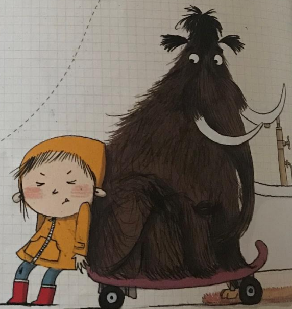
Fig. 3: Skateboard