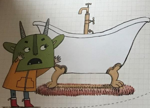
Fig. 2: Spooky mask