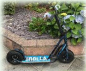
Bikes & Scooters