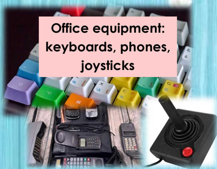
Office equipment: keyboards, phones, joysticks