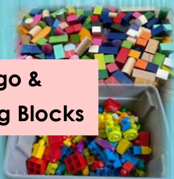
Lego & Building Blocks