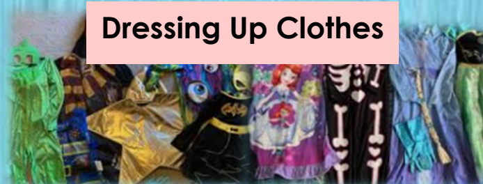
Dressing Up Clothes