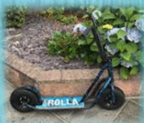
Bikes & Scooters